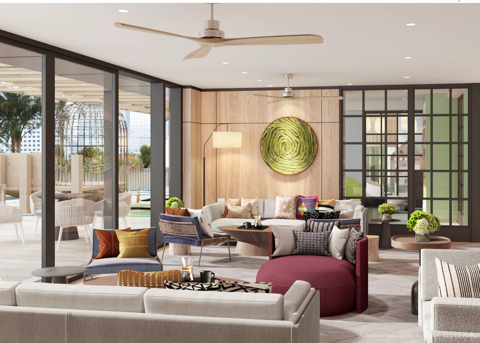
Amenities Lounge Area

*Artist's perspective for illustration purposes only.