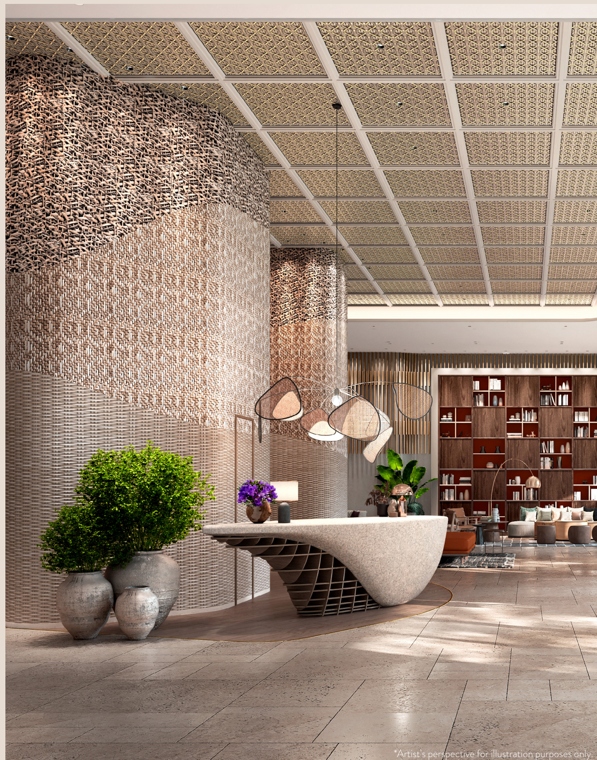
The curvilinear concierge desk at the Grand Lobby serves as the first port of call for Shang Properties' signature property management services.