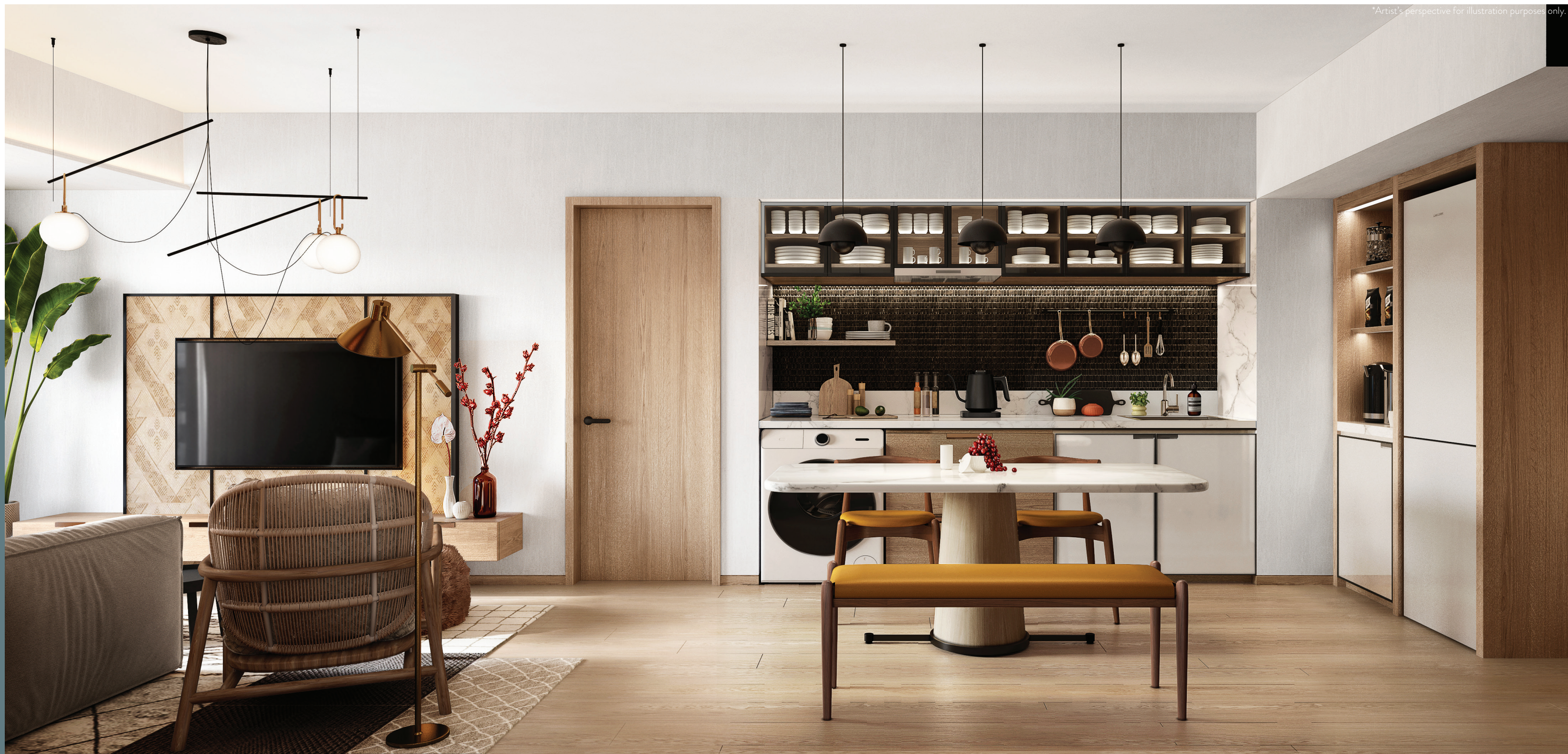
Dining and Kitchen Area