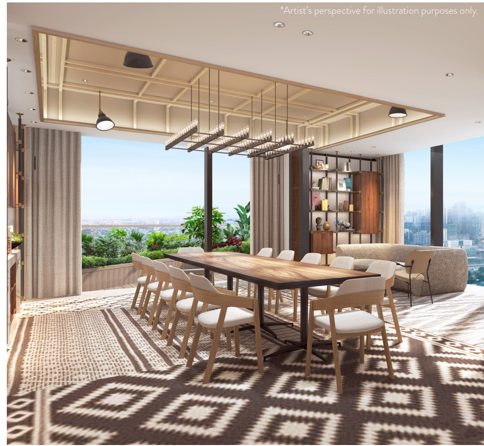
The Drawing Room