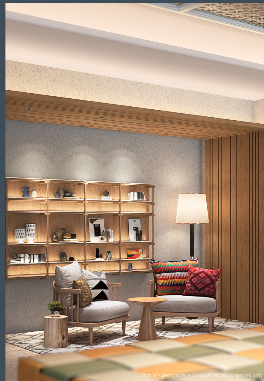
*Artist's perspective for illustration purposes only.

A contemporary home is many things—it is as much a space to nest and rejuvenate as it is a place to grow and connect. With soaring lounge spaces and world-class amenities, Laya offers the freedom to cultivate a home to suit your needs.