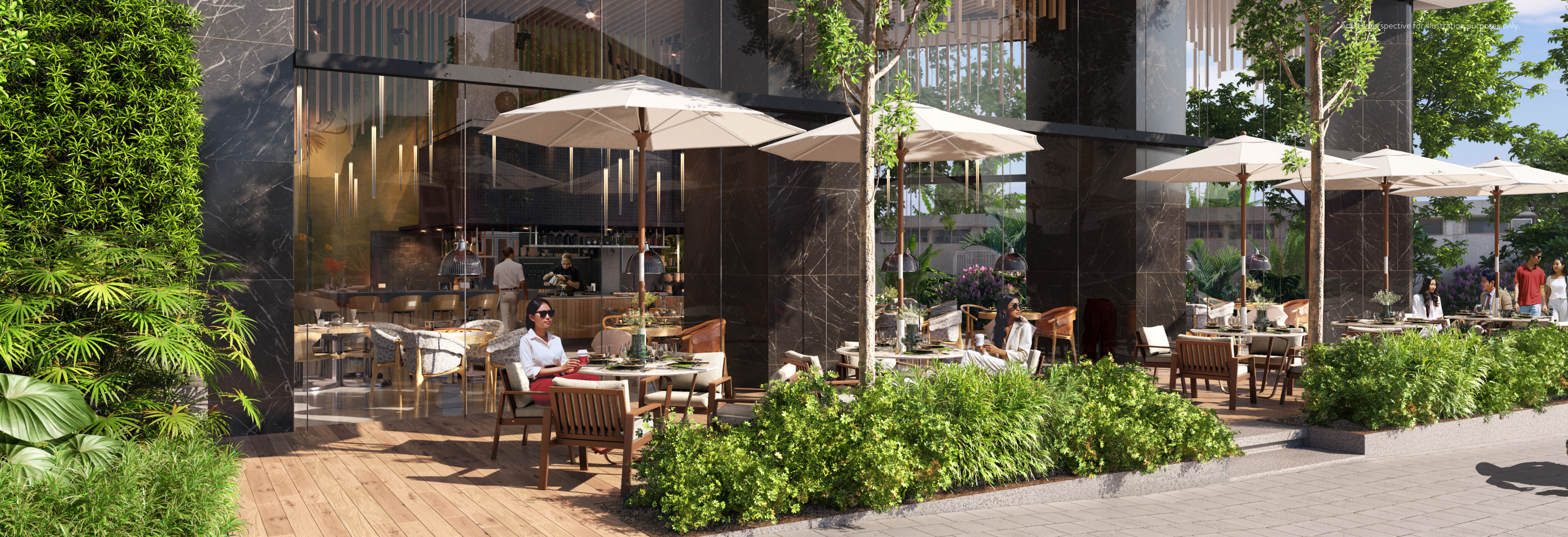
Outdoor Retail Area