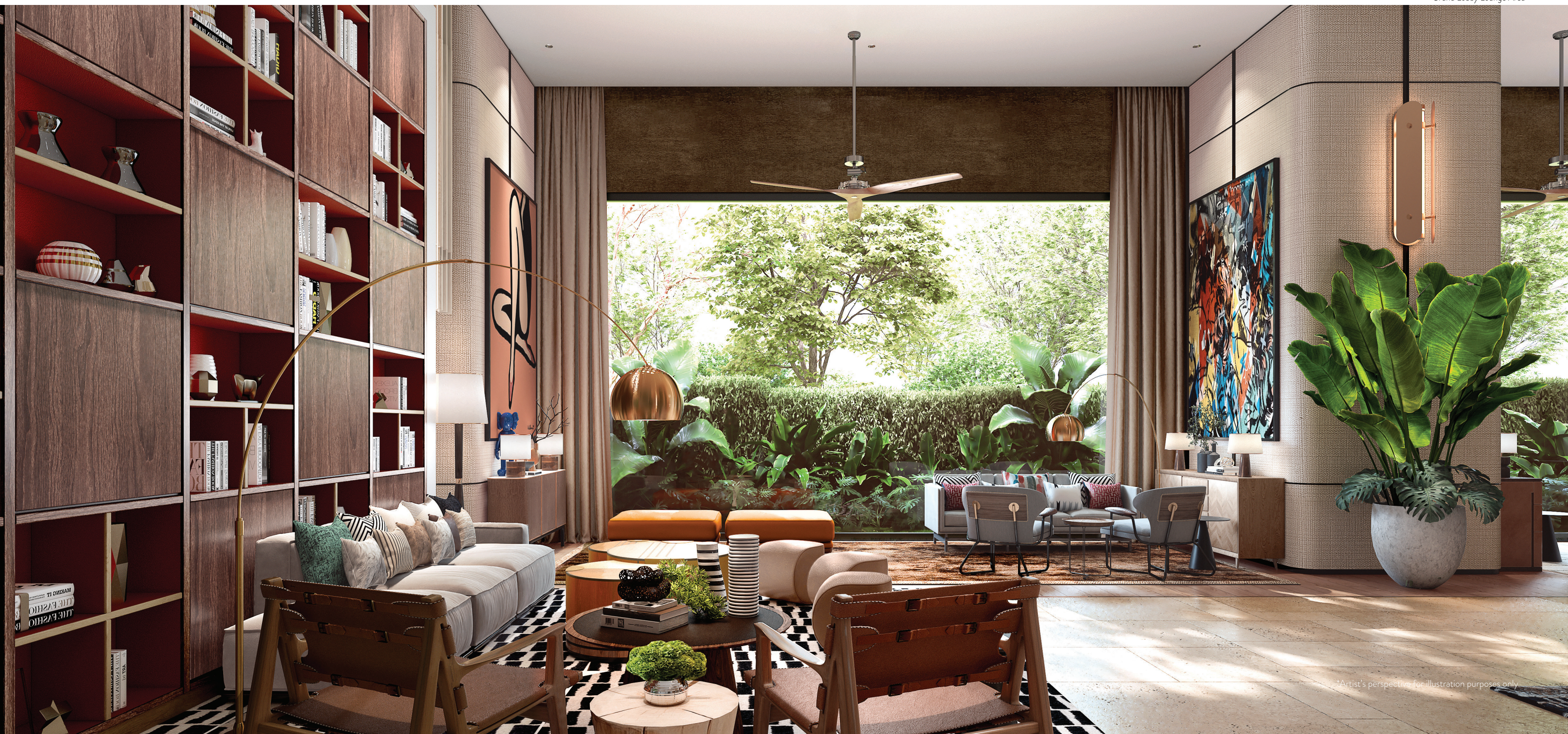
Grand Lobby Lounge Area

The airy, double-height Grand Lobby welcomes you home. Featuring artwork curated from local and international artists, beautiful custom furnishing, and cozy seating areas, the Grand Lobby is the perfect place to unwind and socialize.