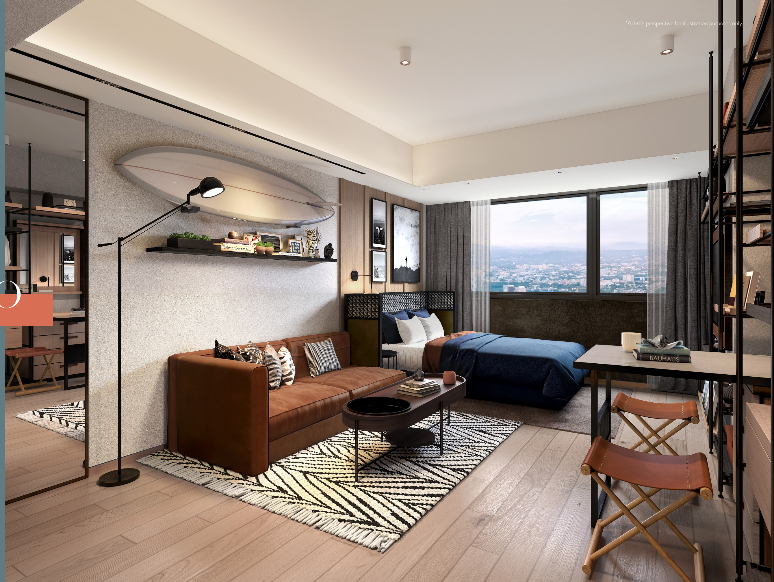
Living and Bedroom Area from entrance

A simple layout that is anything but simple: with ample storage, a streamlined living and dining space, and contemporary bathroom / kitchen fixtures, The Studio is everything you need to begin your next chapter.