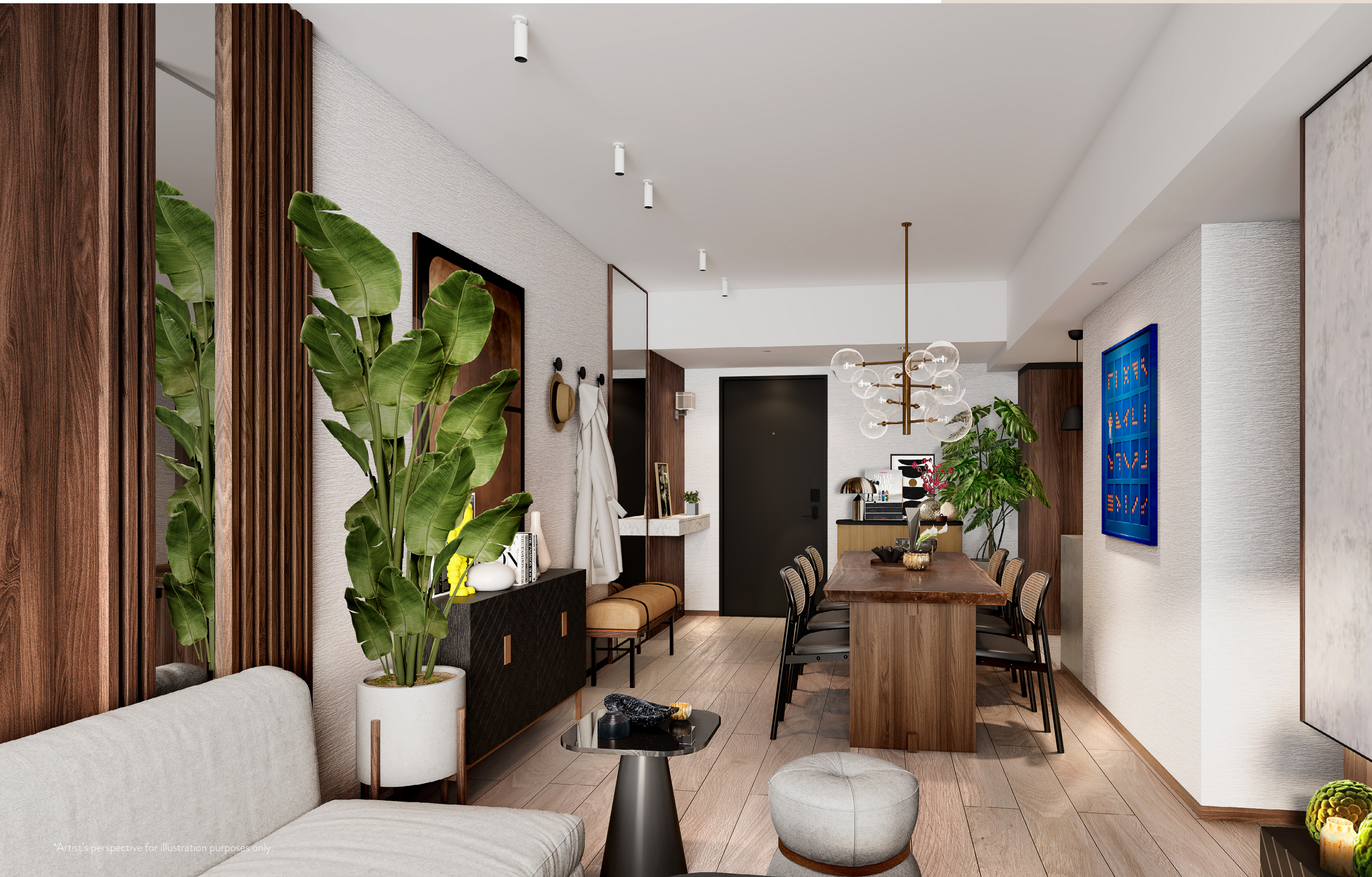
Dining and Kitchen Area from Living Room

*Artist's perspective for illustration purposes only.