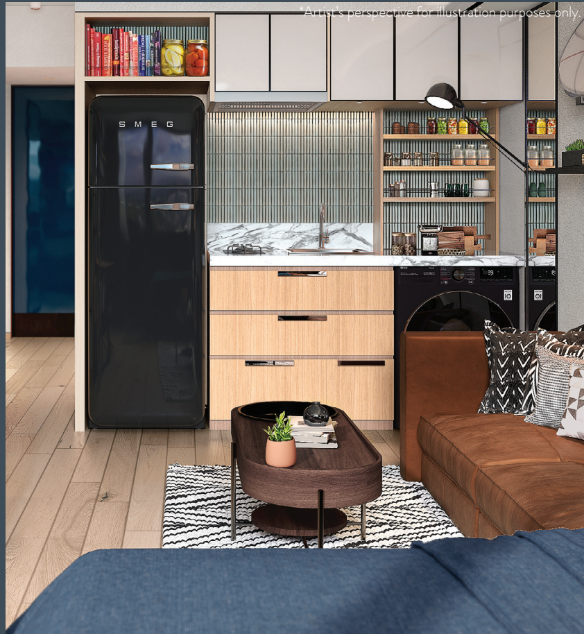
Kitchen Area from bed