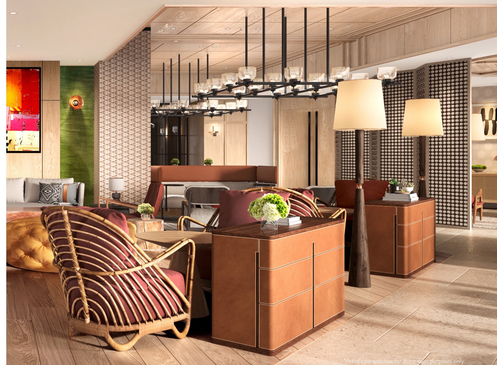
Amenities Lounge Area

*Artist's perspective for illustration purposes only.